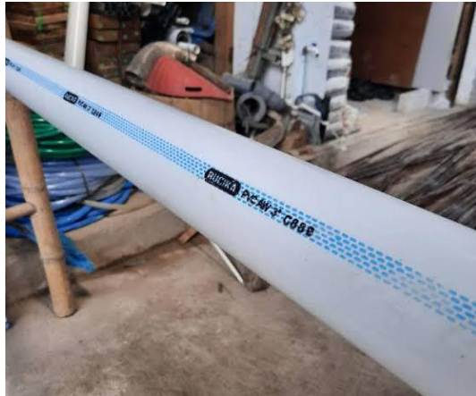
Pipa inlet 2 inch