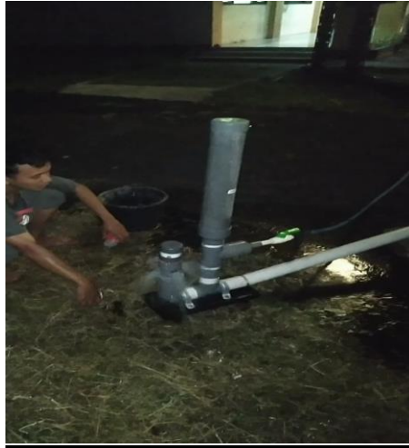
Pengamatan Kerja Pompa Hydrant