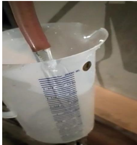
Pengukuran Debit Pipa In lite